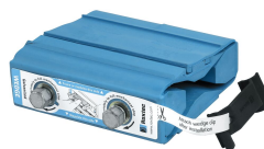
Wedge & Wedgekit